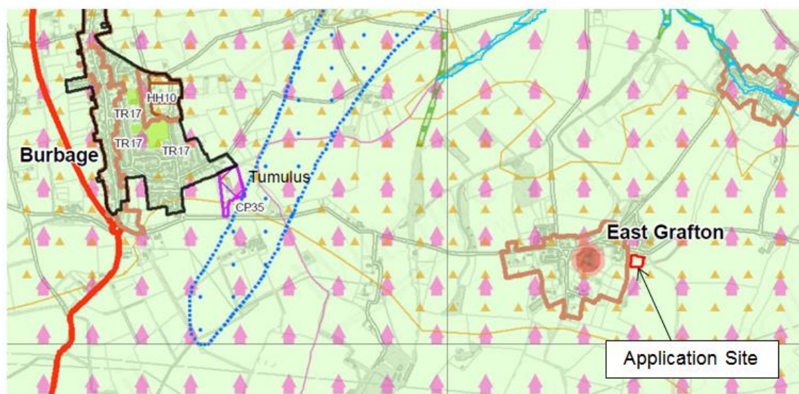
Extract from Wiltshire Core Strategy policy map (green shading: AONB; brown line: conservation area; brown triangles: Grade 1 agricultural land)

The site and all surrounding land lies within the North Wessex Downs AONB. Likewise, the site and all surrounding land is classified as Grade 1 agricultural land. A relatively small part of the west side of the site lies within the East Grafton Conservation Area (land to the east, including Granary Close, lies within the conservation area).